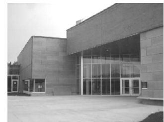
MAIN ENTRANCE OF THE NEW, TWO-STORY SOUTH JUNIOR HIGH SCHOOL BUILDING

monumental event this fall was the opening of the new South Junior High building (construction will be completed by the end of October 2007). Construction also wrapped up on Broken Arrow Elementary, Central Junior High, Free State High School, Lawrence High School, Southwest Junior High and West Junior High.