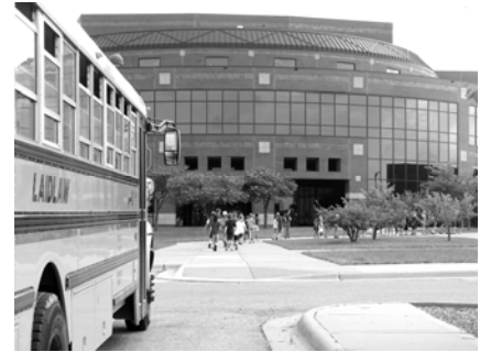
STUDENTS VISIT THE LIED CENTER TO SEE A PERFORMANCE.

ticipate in workshops that will address integrating the arts into the classroom and tie to upcoming performing arts experience at the Lied Center, KU Theater and the Lawrence Arts Center. The workshop will take place on July 30 at various locations downtown. The 3rd Grade Arts Day will expose local third graders to the various elements that make up theater by rotating through various stations to experience theater art.